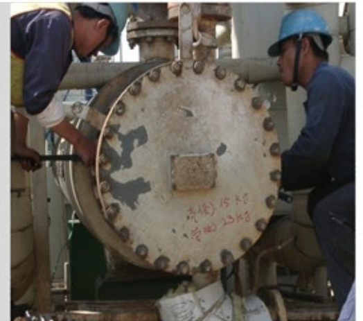
Compress SLADE Joint Sealant to Shape and Seal

Above Fast Emergency Repair Procedure Is Proven In Many Installations.