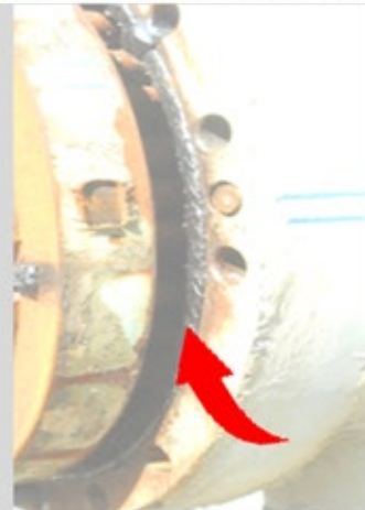
Install New SLADE Joint Sealant In-situ